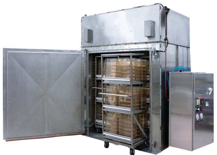
Sterilizer shown with three of the four bays loaded.